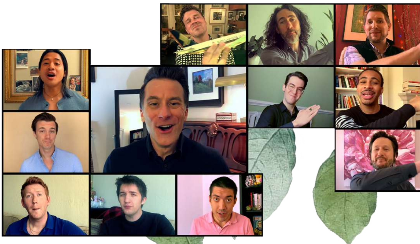
*Special Performance of Chanticleer at the Closing Ceremony BCS-2 nd World Virtual Choir Festival 2020

Event Website: https://bandungchoral.com/wvcf3